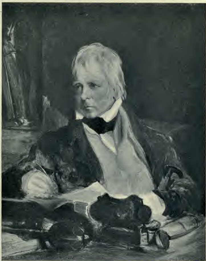
SIR WALTER SCOTT.

From the Portrait by Sir Edwin Landseer, R.A., in the National Portrait Gallery.